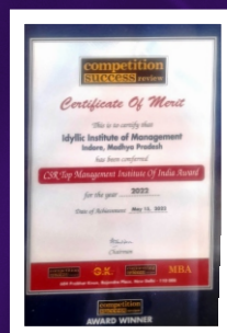
"Top Management Institute in MP" by CSR in 2021