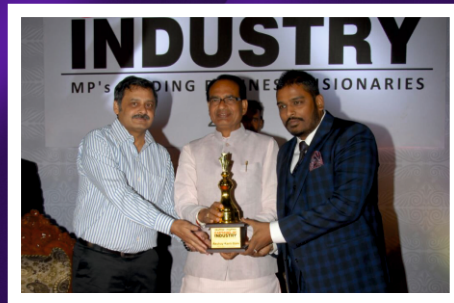
Recipient of CAPTAINS OF INDUSTRY Award 2015