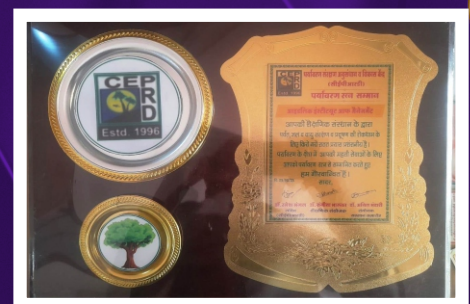
"Pariyavar Ratna Award" by CEPRD in 2023