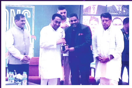
Icons Of Madhya Pradesh Award Of Excellence BY OUTLOOK