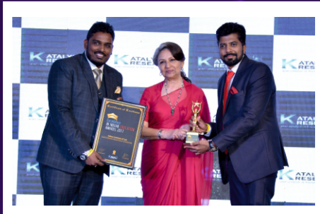
CERTIFICATE OF EXCELLENCE Excellence in Indian Education Award-2016 Best Commerce & Management Institute in M. P