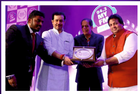
Madhya Pradesh Entrepreneur & EXCELLENCE AWARD 2016