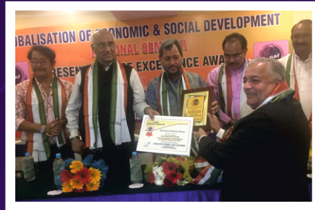
Honors Of Excellence RASHTRIYA SHIKSHA RATAN By Global Achievers Foundation-2017