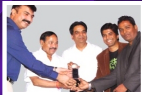
My fm/ida REALITY KINGS AWARD FOR BEST EDUCATION BUILDING OF CENTRAL INDIA-2012-13