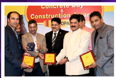
Best Concrete Structure In Private Sector CONSTRUCTIONS AWARDS 2014 by Ultra Tech